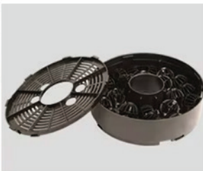
Single-Deck Bio Ball