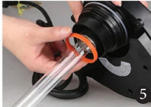
5. Take out the sealing ring