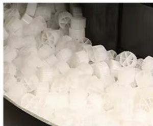
Enhanced Bio Ball