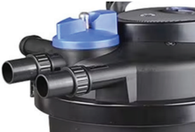
Step 3: Install the water outlet