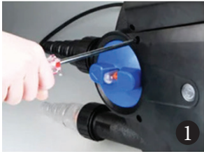
1. Unscrew the screw