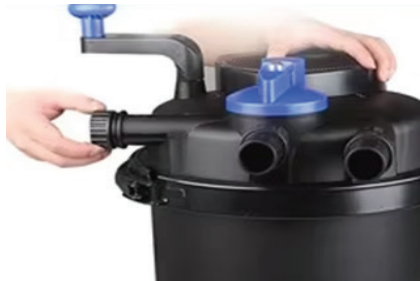
Step 5: Block the sewage outlet

Filter the Barrel. If there's a need for sewage cleaning, Open the water pipe again.