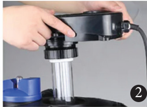
2. Take out the UV lamp