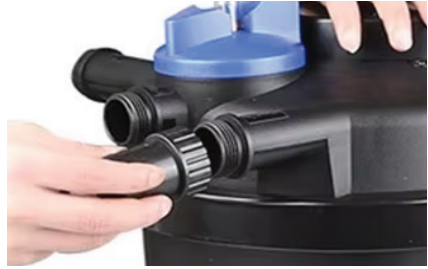
Step 2: Install the water inlet