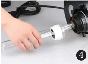
4. Take out the UV lamp shade