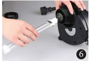
6. Pull out the UV lamp