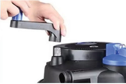
Step 1: Install the cleaning rocker

DPFA-5000 | DPFA-10000 | DPFA-15000 | DPFA-20000 | DPFA-30000 | DPFA-50000