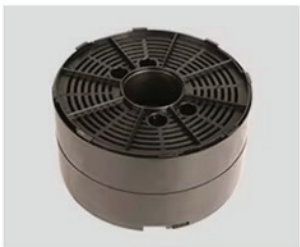
Double-Deck Bio Ball