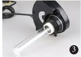
3. UV lamp display