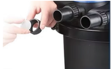
Step 4: Install the plug